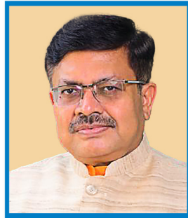
Shri. Prithviraj Harichandan Hon'ble Minister of Law, Works and Excise, Government of Odisha.